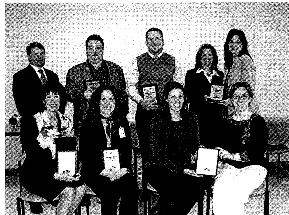
2007 Partners in Parks—(B) Stock and Leader, Coldwell Banker, Susquehanna Bank, Commerce Bank. (F) Hogg Construction, Orthopaedic & Spine Specialists, JMT